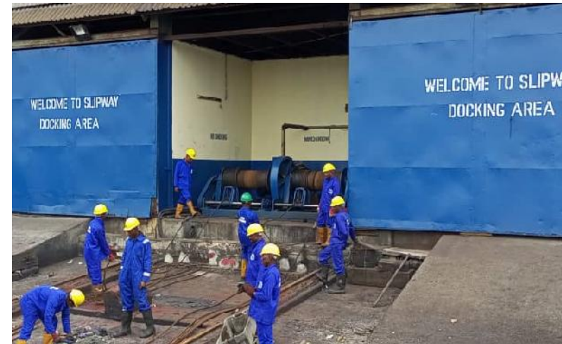
Docking of Crew boat at Taraba Jetty Slipway for repairs

We have the capability to execute bow thruster and Azimuth Thruster removals and re installations. We carry out such repairs in collaboration with their OEM. This can be done while the vessel is afloat or trimmed, to reduce or eliminate interruption to the operational schedule of the vessel. Alternatively, we can remove the thruster, blind the foundation hole and transport the thruster to our workshop for repairs and return to fix it back at wherever the vessel is berthed