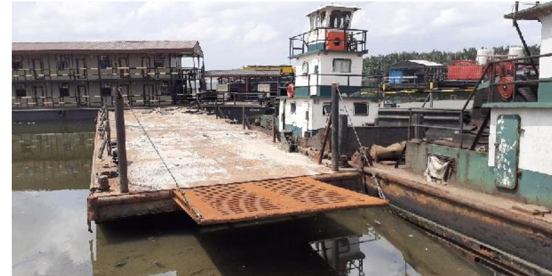
Vessel Conversion & refurbishment to the standard of new