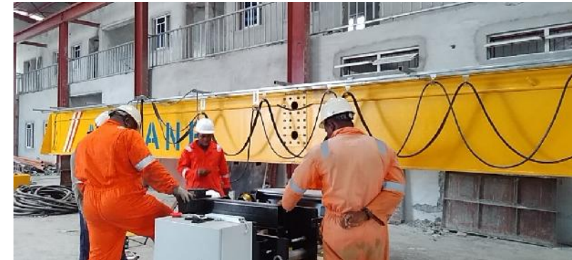
10 Ton Crane Installation on runway beams @ Topline workshop