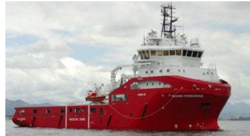
Barge & Tug boat operations. Ready to load cargo to Bonny